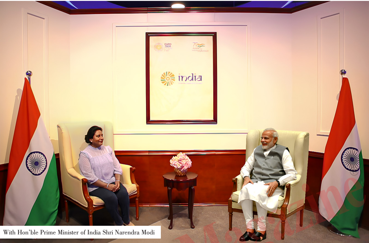
With Hon'ble Prime Minister of India Shri Narendra Modi

Today, The Indian Lawyer & Allied Services has grown into a PAN-India, full-service law firm, having its offices in New Delhi, Mumbai, Hyderabad, Chennai & Darjeeling. The team works across corporate and commercial law, dispute resolution, compliance and business consultancy. What makes them different is their ability to combine legal expertise with a practical business outlook. From drafting fool proof contracts and guiding companies through complex regulatory frameworks to handling high-stake disputes through arbitration, mediation, or litigation, they give clients solutions that are legally sound and commercially viable.