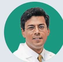
Dr. Atul Gawande Endocrine Surgeon -Brigham and Women's Hospital -Boston, Massachusetts

"The greatest clinicians who I know seem to have a sixth sense for biases. They understand, almost instinctively, when prior bits of scattered knowledge apply to their patients—but, more important, when they don't apply to their patients."