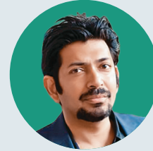
Dr. Siddhartha Mukherje Staff Cancer physician Columbia University Medical Center

"The greatest clinicians who I know seem to have a sixth sense for biases. They understand, almost instinctively, when prior bits of scattered knowledge apply to their patients—but, more important, when they don't apply to their patients."