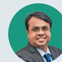
Dr. Abhishek Bhargav

"Mental health in pregnancy is one of the most overlooked issues. The holistic approach to pregnancy care should include not only physical but also mental wellbeing by un- stigmatising mental illnesses. This will ensure preventable sequels like depression, psychosis and grave outcomes like maternal suicide- demanding stronger policy, funding, and media attention.."