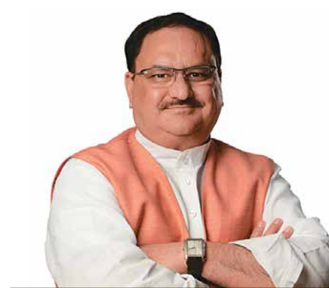
J. P. Nadda Health Minister

As this transformation unfolds, the focus must remain on inclusivity, sustainability, and equity. The goal should be a system where quality healthcare is not a privilege but a right, accessible to all irrespective of geography or economic status. The journey is far from complete, but the momentum is undeniable. A healthier India is no longer a distant vision—it is a dynamic, unfolding reality shaped by collective will and continuous innovation.