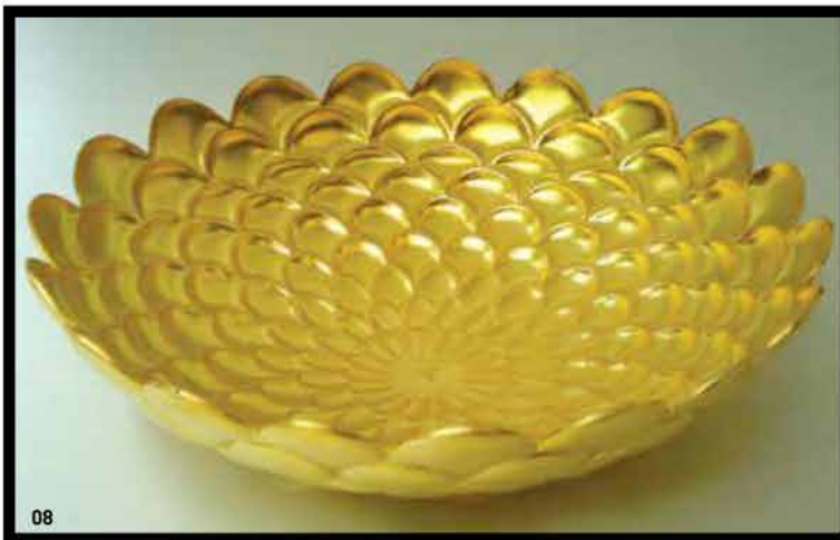
08 Sunflower Bowl. Hand crafted and chased flower brass bowl.