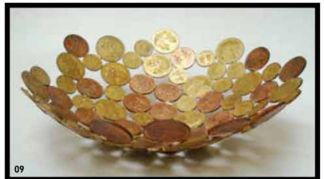
09 Traditional Coin Bowl. Bowl inspired from religious coins and their detailed embossing. Each coin is welded separately.