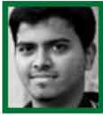
Vinit Dodamani Photographer