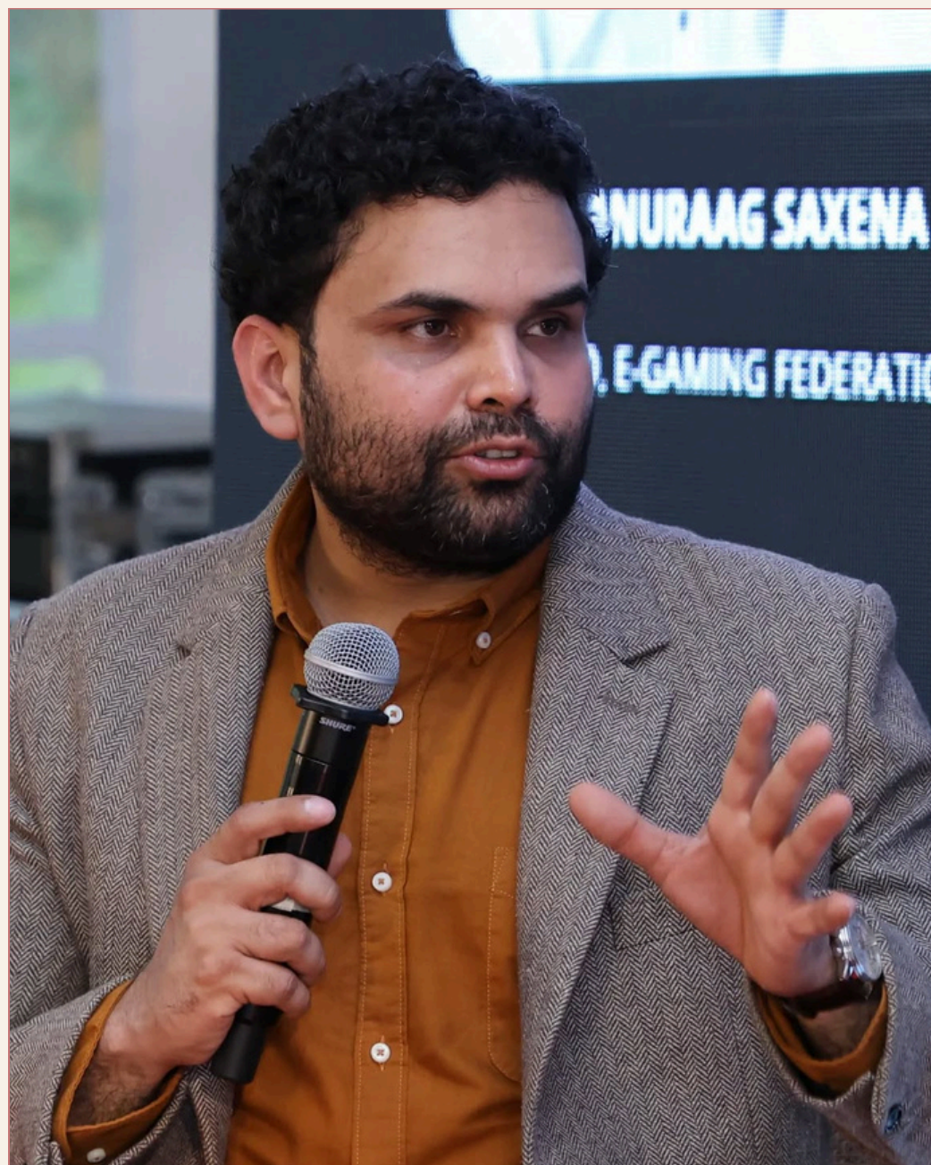
COURSE DIRECTOR · NLU DELHI

He is a regular writer and speaker on Indian corporate and regulatory law, and brings that practical clarity into the classroom. Through the Practice Series, he designs programmes that go beyond textbook law - built around how legal problems actually arise and how practitioners solve them.