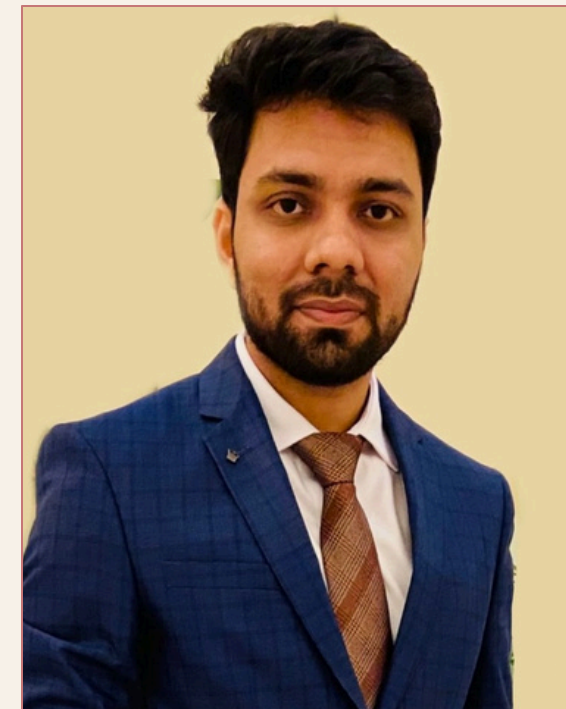
CO-FOUNDER · MENTBLUE