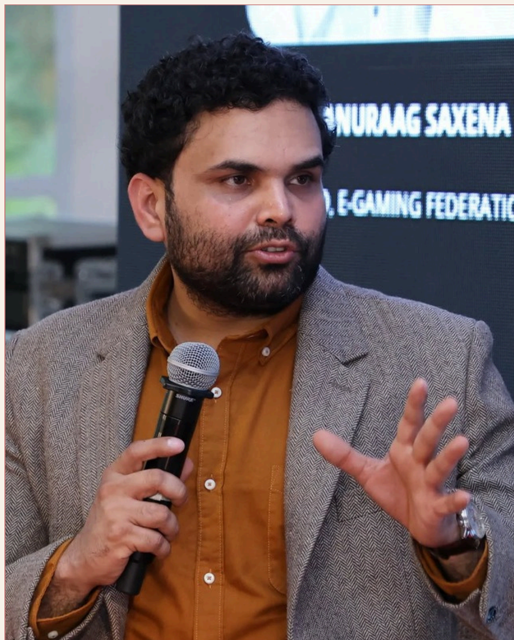
COURSE DIRECTOR · NLU DELHI

He is a regular writer and speaker on Indian corporate and regulatory law, and brings that practical clarity into the classroom. Through the Practice Series, he designs programmes that go beyond textbook law - built around how legal problems actually arise and how practitioners solve them.