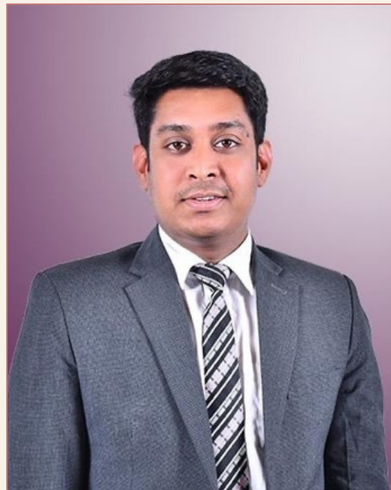
CO-FOUNDER · MENTBLUE

Day-to-day delivery of the programme - admissions, faculty coordination, participant support - is led by the Mentblue team.