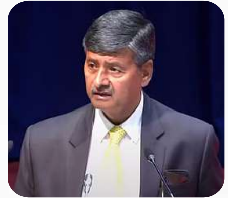
Hon'ble Mr. Justice Ajay Rastogi