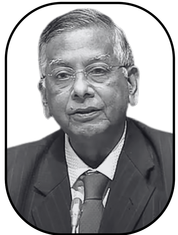
Mr. R. Venkataramani Attorney General for India