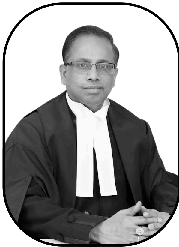
HMJ K. V. Vishwanathan Judge Supreme Court of India