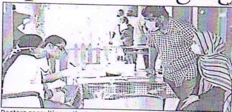
Doctors consulting patients at a Kerala hospital

In one case in Gurgaon, the hospital raised a claim of over Rs 6.70 lakh while the patient is still being treated. The insurance company, so-