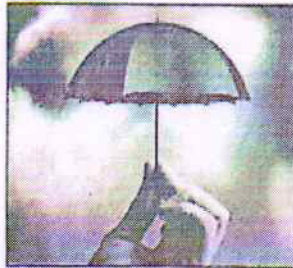
Insurers seek govt intervention for package rates

Hospitals say the approach to Covid-19 patients in terms of treatment is not different. "The drugs and treatment are similar to what we use in the case of oth-